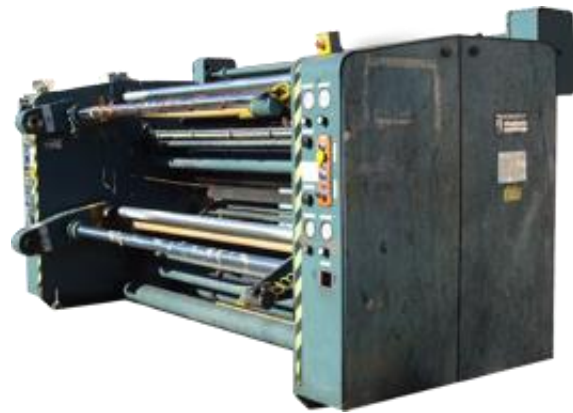
Original Dual Turret Winder Before Rebuild