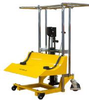
Standard (up to 660lbs.)