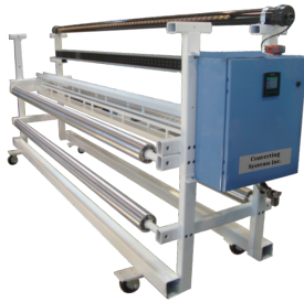
Hole Punch Control System