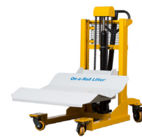
Grande (up to 1540lbs.)

Converting Systems offers several downstream options to expand and increase the productivity of your current process.