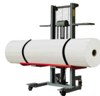
Jumbo (up to 990lbs.)