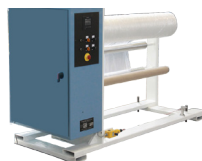
Cantilevered Torque Winder