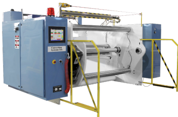
40" Diameter Single Turret Winder Model 4001