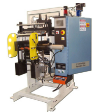
Coreless Winder Model 825

Converting Systems specializes in a variety of winders and unwinders to fit your application, including Single/Dual Turret Center Driven Winders (with auto-cutover, taper tension, individual spindle drives and microprocessor touch screen controls), trim winders, re-winders and driven un-winders. For older winders, CSI provides on-site control system upgrades as well as full rebuilding services, incorporating "new" machine features and a full warranty for a fraction of the cost of a new winder. CSI's "Rebuilding Loaner Program" minimizes downtime. Visit www.ConvertingSystems.com for specifications or search www.CSI-Parts.com to order replacement parts for all makes and models.