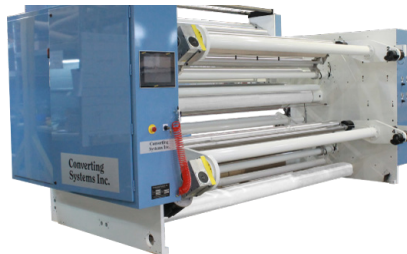
24" Diameter Dual Turret Winder Model 2401