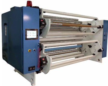
30" Diameter Dual Turret Winder Model 3001