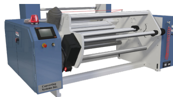
32" Single Turret Winder Model 3001S