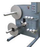
Trim Winders Dual Spindle & Model 18E