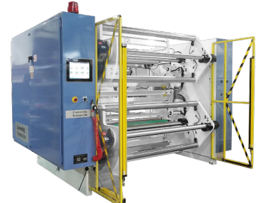
30" Diameter Dual Turret Winder Model 3011